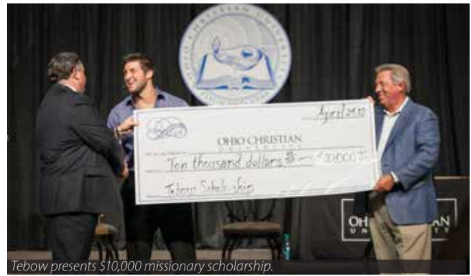
Tebow presents $10,000 missionary scholarship.

“Someone is probably watching you, and their life is affected either in a good way or in a bad way because of what you do,” Tebow said.