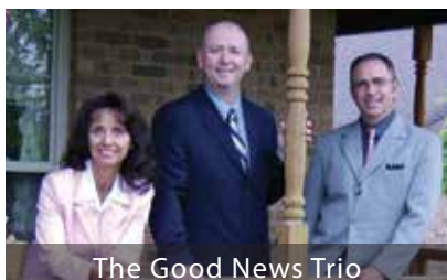
The Good News Trio