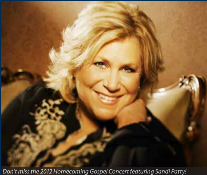
Don't miss the 2012 Homecoming Gospel Concert featuring Sandi Patty!

Join us for this year's Homecoming, which will feature events for the whole family including class reunions, alumni athletic games, a tailgating party, and our first Throwback Chapel featuring former music groups and a special alumni speaker. Mark your calendars for OCU's finest Homecoming yet.