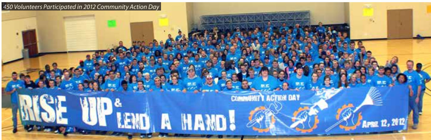
450 Volunteers Participated in 2012 Community Action Day