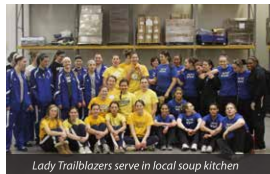
Lady Trailblazers serve in local soup kitchen